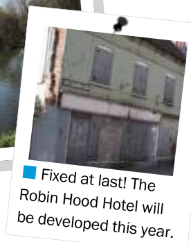
Fixed at last! The Robin Hood Hotel will be developed this year.